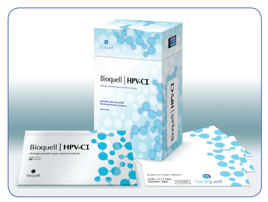
Image 1. Bioquell HPV-CIs provide a simple, easy to use indication of a successful Bioquell HPV bio-decontamination process

Bioquell HPV-CI is a simple visual indicator of the effectiveness of a Bioquell hydrogen peroxide vapour (HPV) bio-decontamination cycle. It has been developed to complement standard biological indicators*.