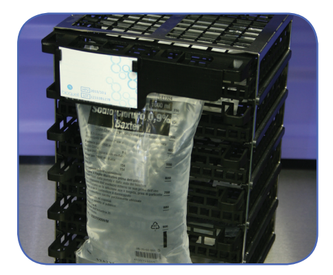
Image 3. After a Bioquell HPV bio-decontamination, the colour of the indicator portion can be used to provide an early indication of the reduction in bioburden (e.g. >6-log)