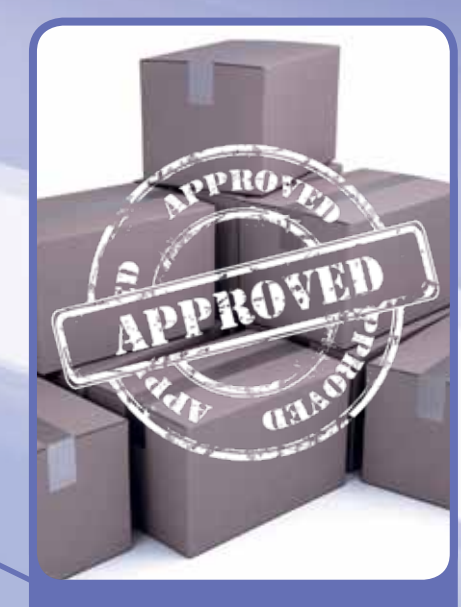
After 14 days, negative results allow batch release

Samples can be rapidly removed through optional material transfer devices