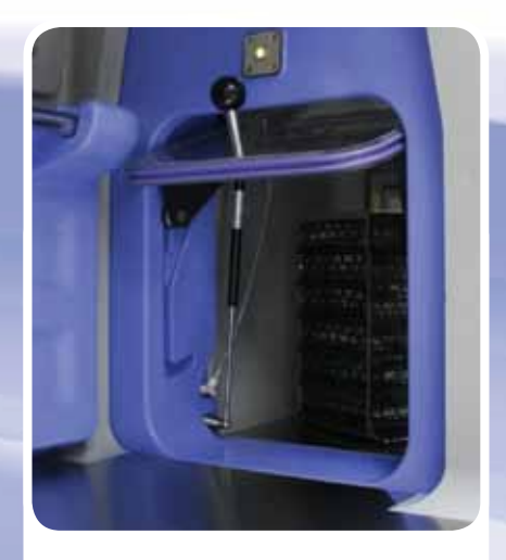
The samples and test kits are transferred to the extension chamber