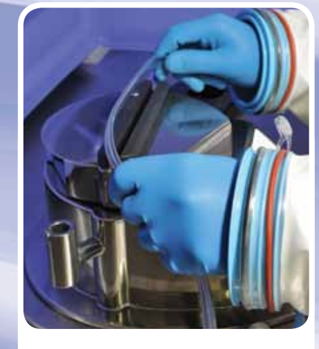
In the extension chamber, the samples can be prepared using integrated sterility test pump

The ability to perform biodecontamination in one module whilst working in the other means operator time is maximised