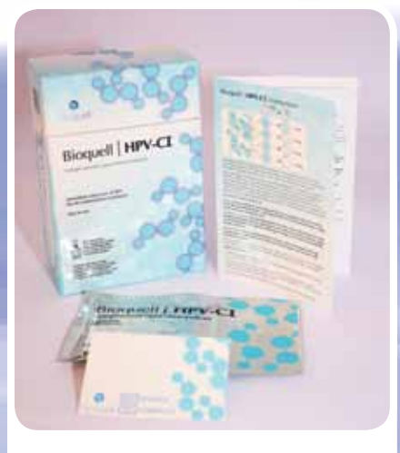
Bio-decontamination can be monitored in real-time with Bioquell HPV-CIs