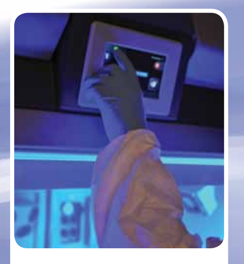
Samples and test kits are placed in the Bioquell QUBE and the HPV process is started