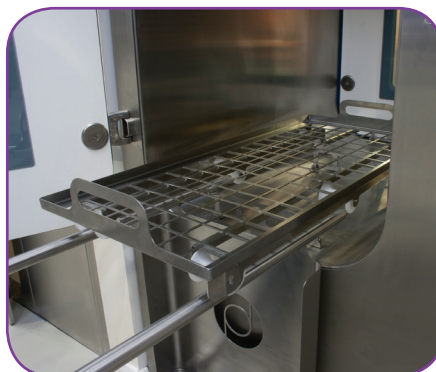
Image 2. Bioquell's cart-to-cart system allows for a smooth and safe transfer of materials