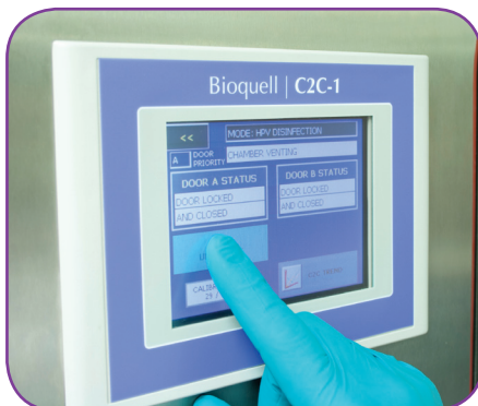
Image 1. Specially designed easy to use colour touch panel controls

The Bioquell C2C-1 is ideal for use in GMP regulated, or non-regulated areas including food manufacturing/processing, laboratories, biomedical facilities, biosafety/biosecurity areas and healthcare facilities.