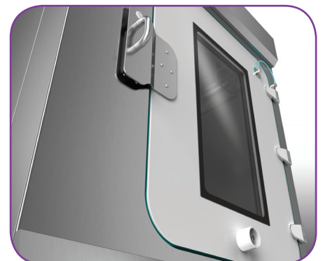
Image 3. Selectable interlock priority points are available for safe entry and exit